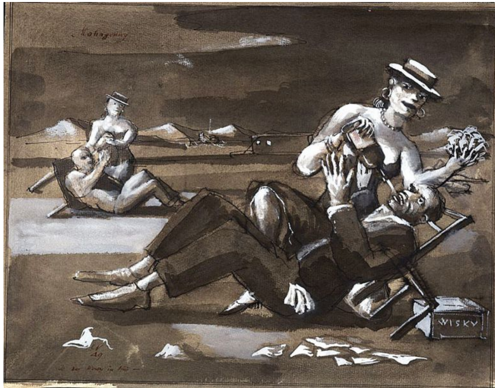
Projection displays by Caspar Neher for the premiere of "Rise and Fall of the City of Mahagonny"