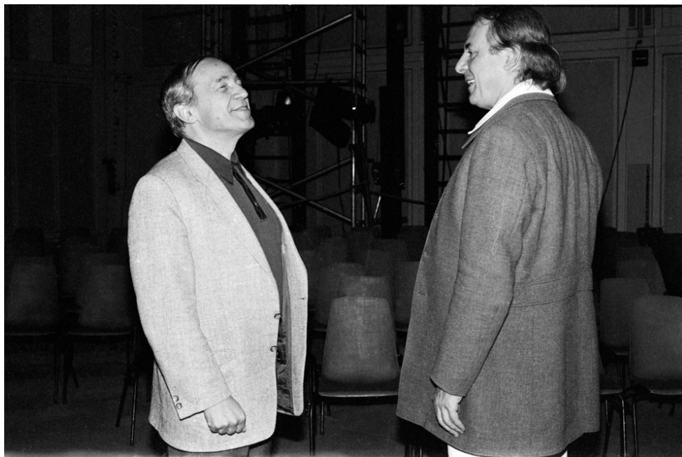
Pierre Boulez and Karlheinz Stockhausen at IRCAM, 1983