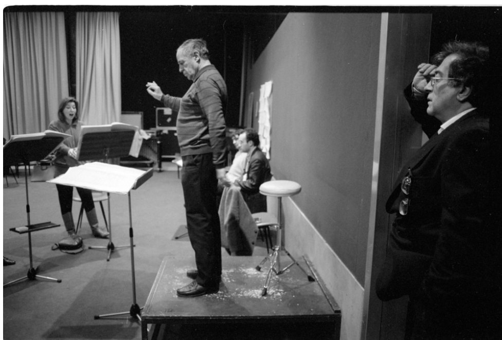
Pierre Boulez rehearses a work by Luciano Berio with the Ensemble Intercontemporain, Paris 1989