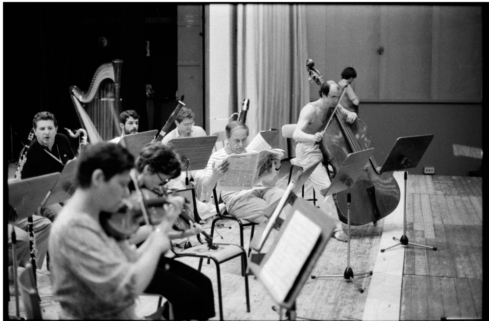
Pierre Boulez and musicians of Ensemble Intercontemporain during rehearsals at the festival Grange de Meslay in 1985

It's the photographs that show Boulez in cooperation with his great colleagues that are of music historical relevance: Luciano Berio, Friedrich Cerha, Karlheinz Stockhausen.