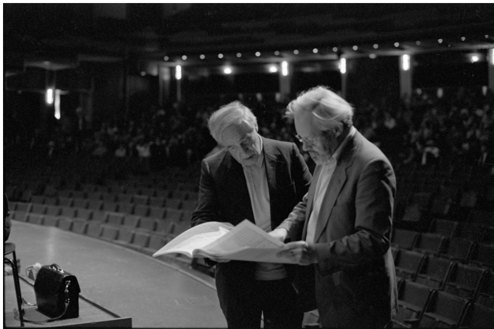
Pierre Boulez and Friedrich Cerha study Impulse by Cerha at a rehearsal in Salzburg in 1996